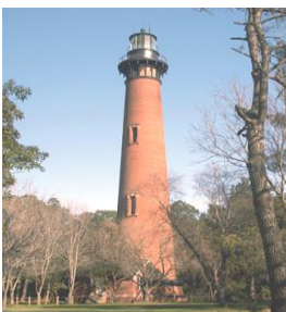
Currituck Beach Lighthouse