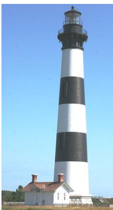
Bodie Island Lighthouse

Thanks for your help in sending kids to camp!