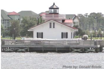
Roanoke Marshes Lighthouse